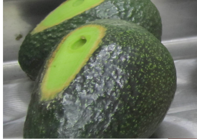
Ripening over 50 million Avocados in Our Rooms Every Day!

Superior Supervisory Options are available. The Supervisory Computer package provides for back-up controls, continuous data logging and remote troubleshooting. Rooms can be monitored at all times through a remote location.